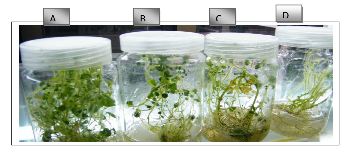
Fig 1 : Micropropagatd PVY- free potato plantlets growing under osmotic potential on MS medium at 25^{0} C. (A) at 30 gl<sup>-1</sup> (B) at 50 gl<sup>-1</sup> sucrose , (C) at 60 gl<sup>-1</sup> sucrose and (D) at 70 gl<sup>-1</sup> sucrose.